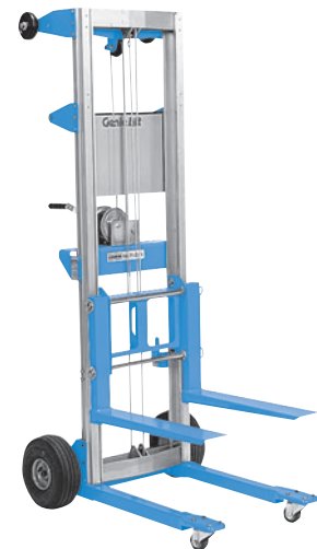
(1) Available aftermarket only